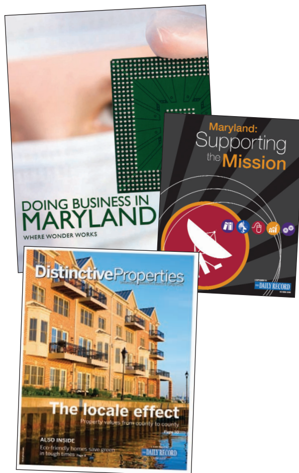
Magazine special section

Preferred position: earned frequency + 15%